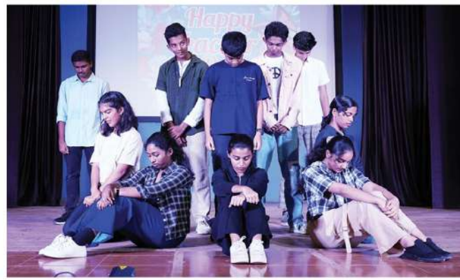
Contemporary Dance performance by the Plus One students