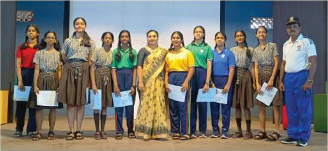
CISCE Under 17 (Girls) E zone Basketball team