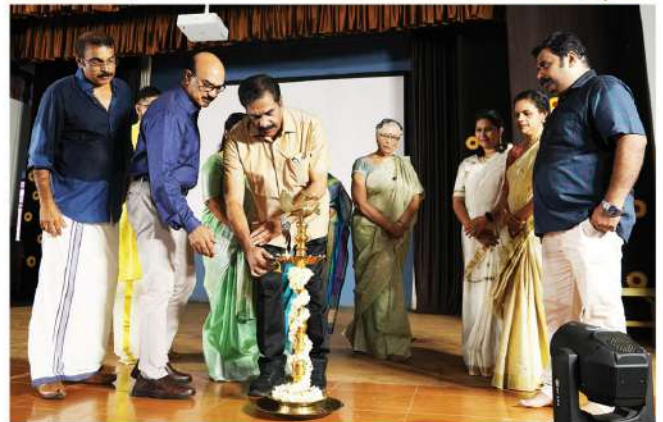
The start of the Onam celebration with the lighting of the lamp

With the receding monsoon, everyone was in a mood to celebrate Onam and Hari Sri is known never to take a back seat during such vibrant events. So, the junior captains, senior captains and students performed a dance which added to the vibrancy, truly capturing the essence of the day. The eye-opener of this dance was that with the intense examinations, there was very little time for practice to make this perfect; however, the students had practised with their heart and soul, making this a wonderful performance. Their dynamic and dulcet moves made it a feast for the eyes. The performance enthralled the audience making them feel each beat flowering into the spirit of Onam. This performance was an enthusiastic start to Hari Sri's 2024 Onam celebration and we all await the plethora of surprises next year as well.