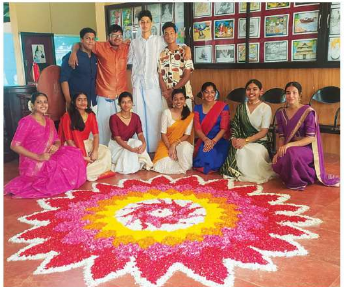
Captains preparing the 'Onapookalam'