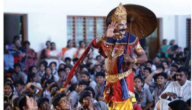
Maveli blessing the children