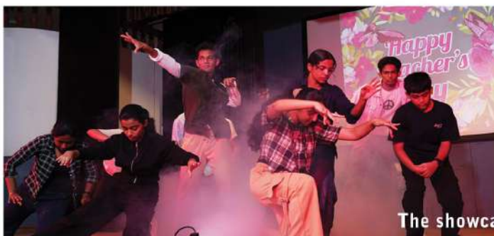
The showcasing of different dance forms by the Plus One children