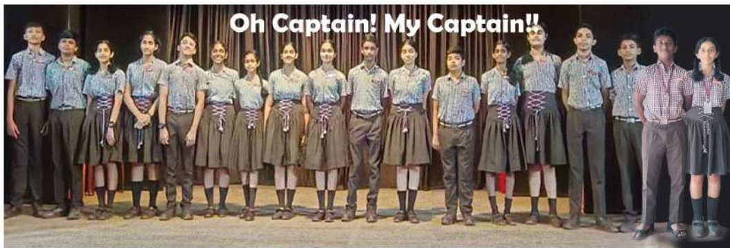
The newly selected Junior Captains