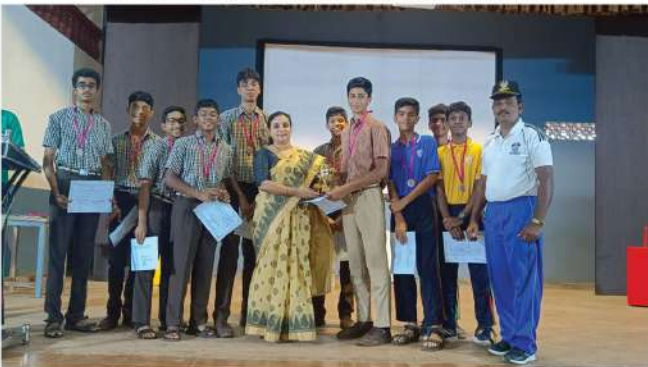
CISCE Under 17 (Boys) E zone Basketball runners-up