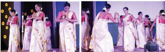
Performance of 'Kaikotti kali' by the parents