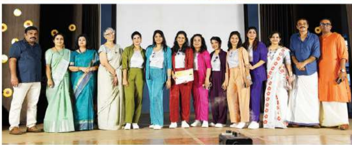
Team members receiving the mementoes from the school authorities