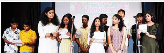
'Recitation' in connection with Teachers' Day celebration