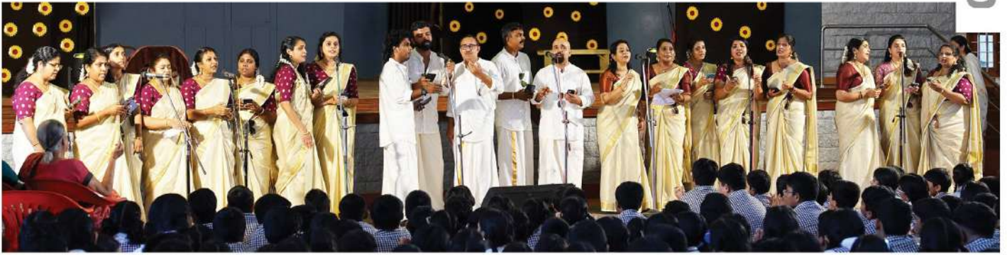
Group Song by the parents