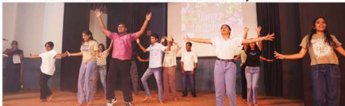
High School children's Dance performance