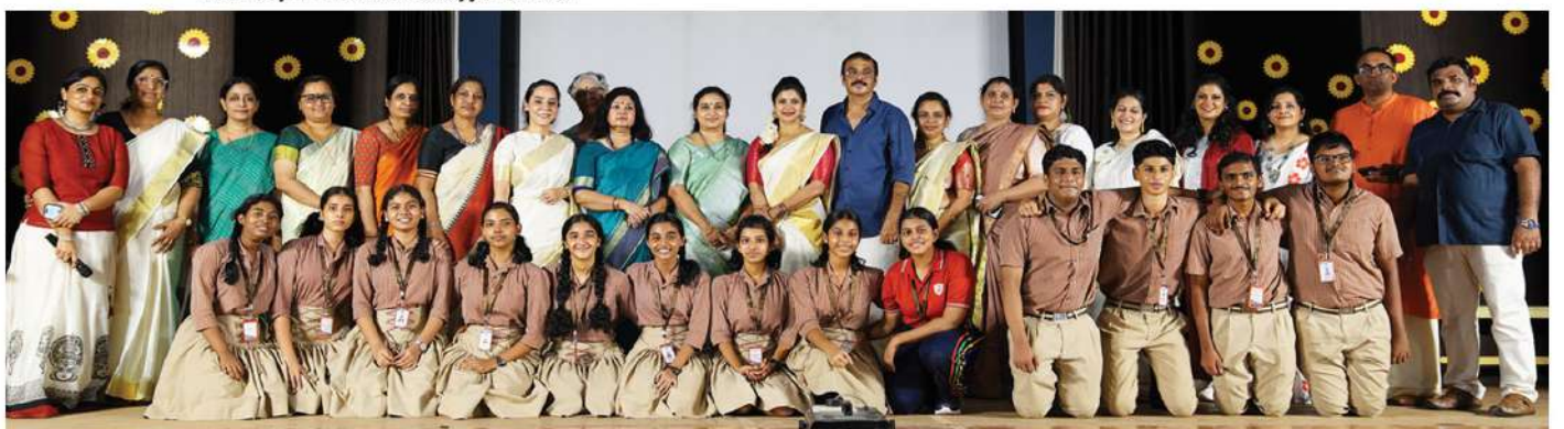
Captains sharing happiness along with the APT Team!