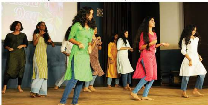
Performance by the Plus One Students