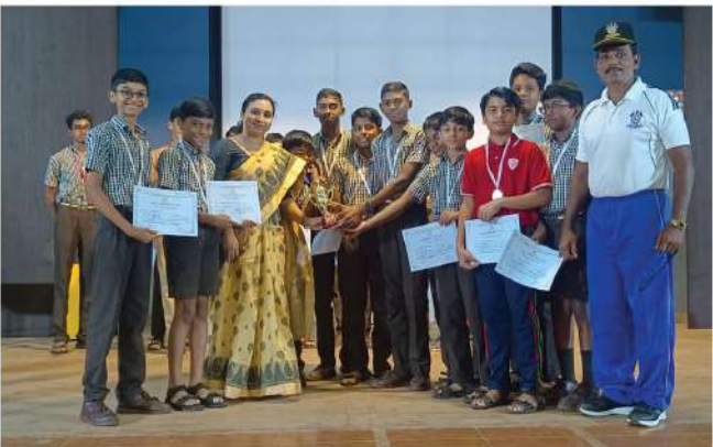
CISCE Under 14 (Boys) E zone Basketball runners-up