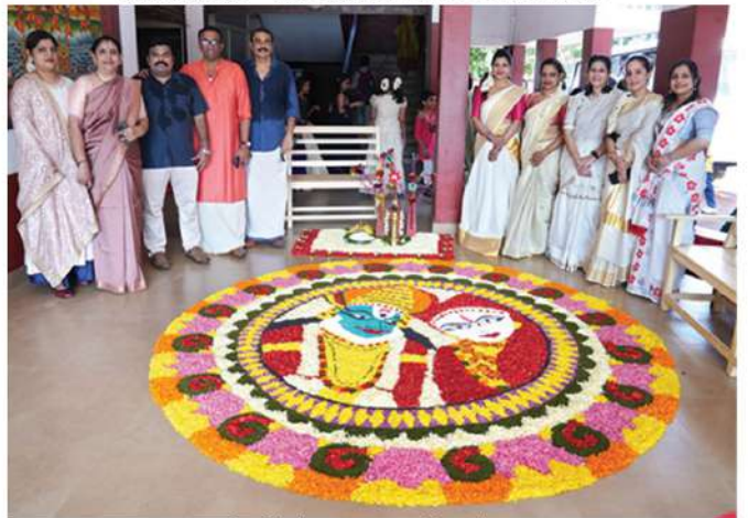
Pookkalam prepared by the parents