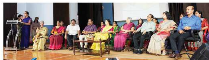
Founder's Day function