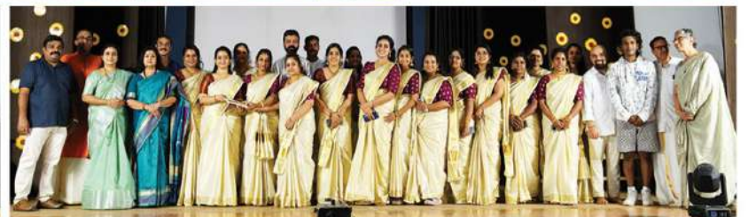
Various team members receiving mementoes from the school authorities