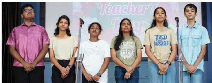
Recitation by the Plus One students