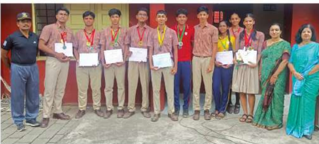
CISCE Regional E-Zone Athletic Meet team with medals