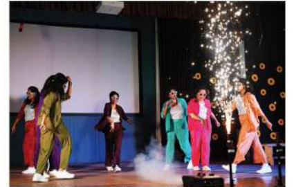
Mannequin Dance Performance