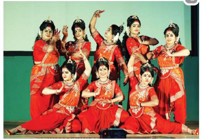
'Ranga pooja' - The Classical Dance Performance