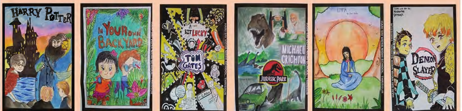
Book Cover Design competition in connection with the Reading Week celebrations.