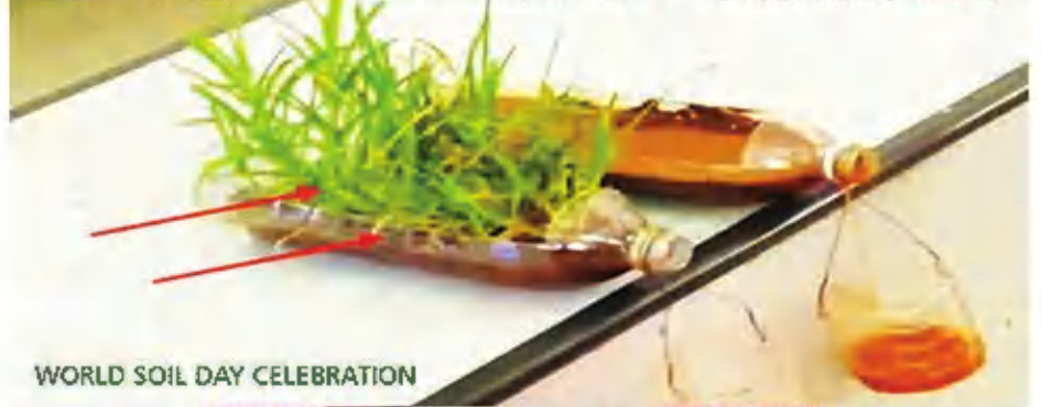
WORLD SOIL DAY CELEBRATION