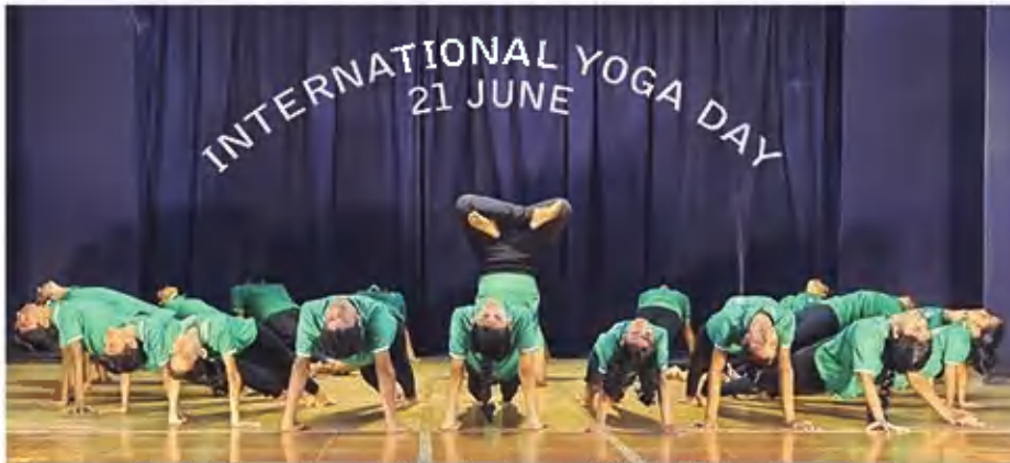
Synchronised show by the students at the school auditorium in connection with the Yoga day on 21st June, 2022

Hari Sri Vidya Nidhi School celebrated the International Yoga Day with a yoga demonstration by children of the school in the school auditorium. Different types of asanas and postures were done on the dais to the tune of Siva shivoham played in the background. The school has included yoga in its curriculum since its early years. A yoga workshop was also conducted for the staff members earlier along by the ESI Department, Thrissur.