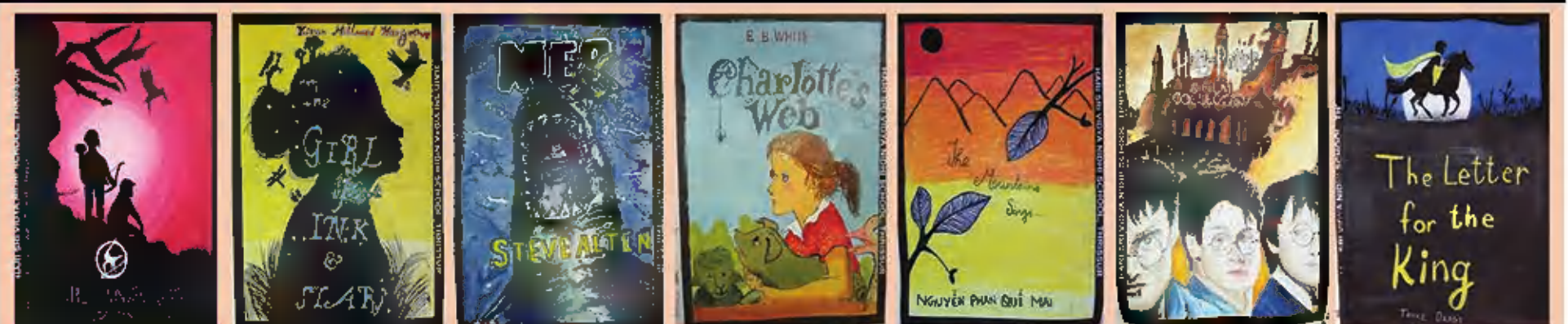
Book Cover Design competition in connection with the Reading Week celebrations.