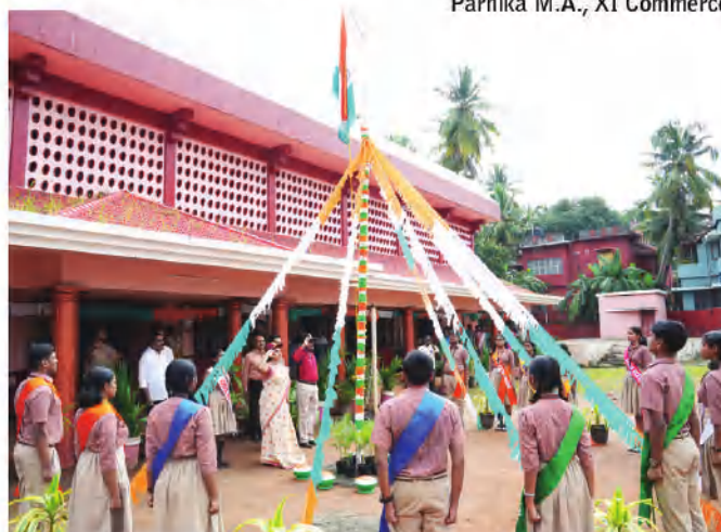
Saluting the National Flag on Independence Day