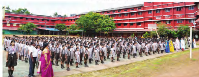
L.P. children assembled on the ground at the time of Flag Hoisting