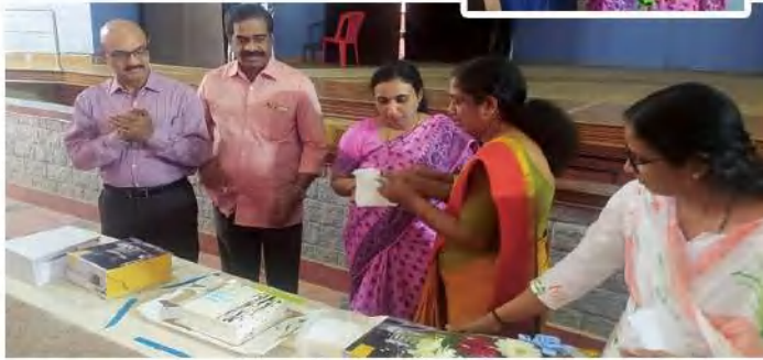
The Cake Cutting Ceremony