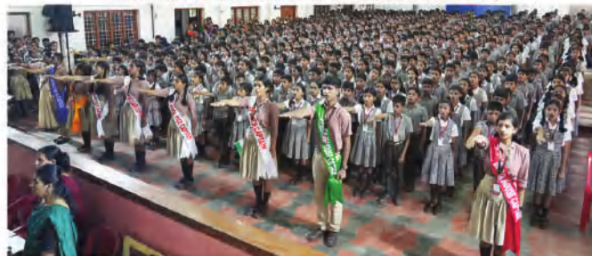
Children taking the Oath