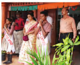
INDEPENDENCE DAY SPEAKERS