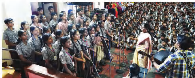
The School Choir