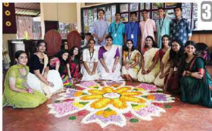
Pookkalam made by the Captains