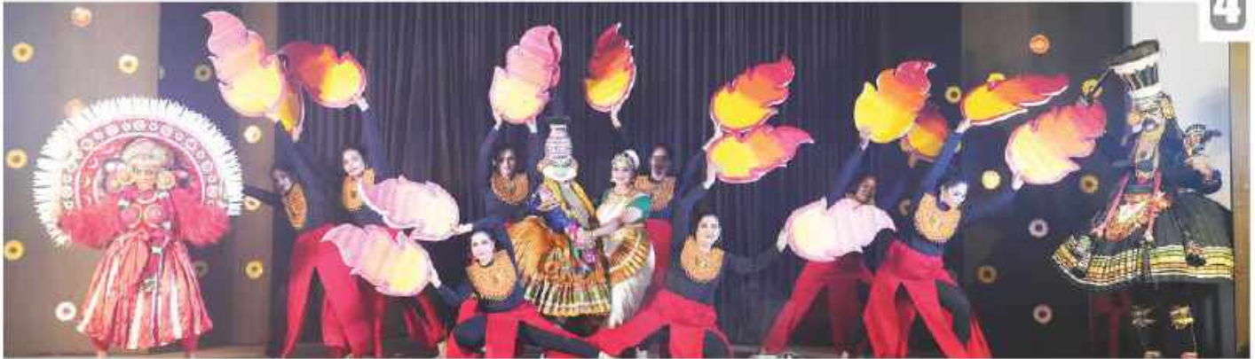
Traditional dance forms