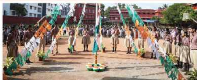
Captains at a glance!