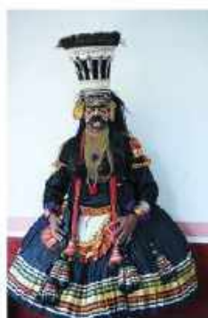
Different art forms