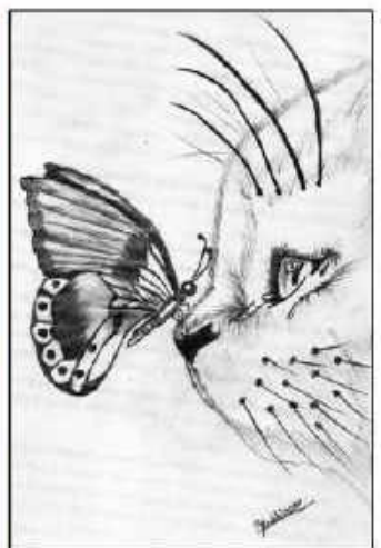
Abhinav VII D