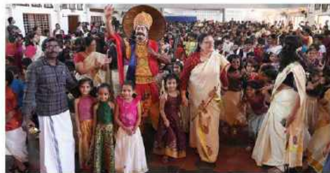
King Mahabali's electrifying presence