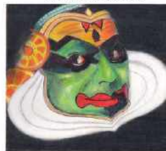
Abdulla Bin Sameer VI C