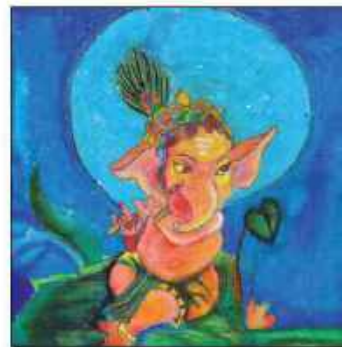
Aarav Arjun IV A