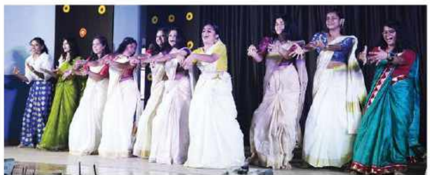
Flash mob by the Plus Two students