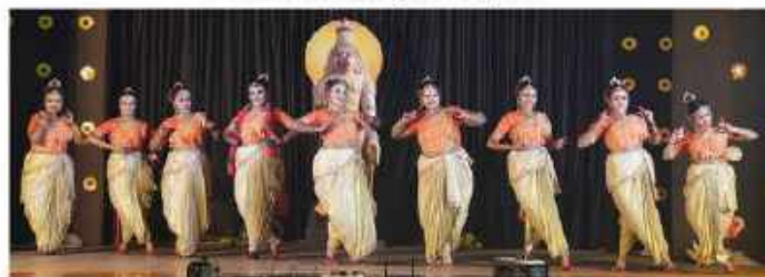
Thematic dance performance